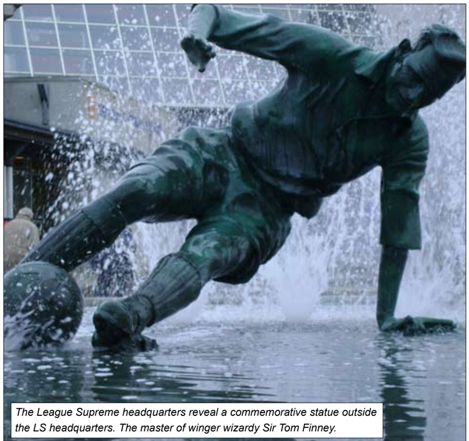
The League Supreme headquarters reveal a commemorative statue outside the LS headquarters. The master of winger wizardry Sir Tom Finney.

"Mind you, looking at Argyles sh*t start to the season, Im inclined to agree!!!" he added. "Although last season when the Green Army came, and conquered, Birchfield, it was clear (and embarrassing) for the Tangerine Army that they were clearly 'outvoiced' by the visiting supporters - which, for Northern mouths is somewhat of an achievement" ;-)